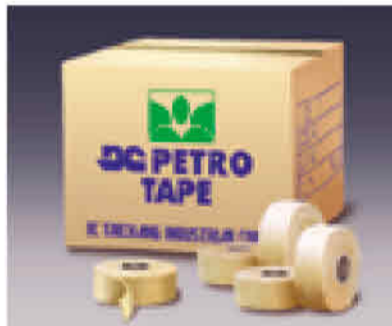
BC Petro Tape