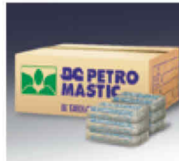
BC Petro Mastic