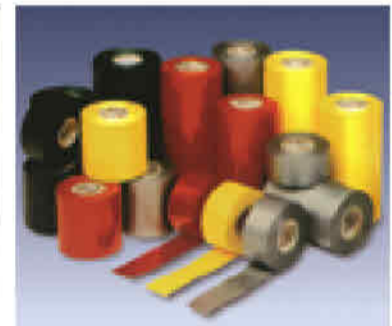
PVC Firm Tape