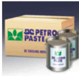
BC Petro Paste